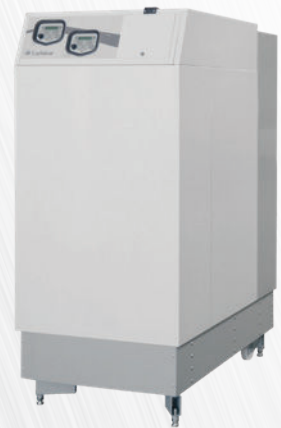
TTW water heater 2 models available

The multiple water heater/storage vessel options provide a great deal of installation flexibility and as such these products are suitable for both new build and retrofit projects, including plant rooms which have space limitations.