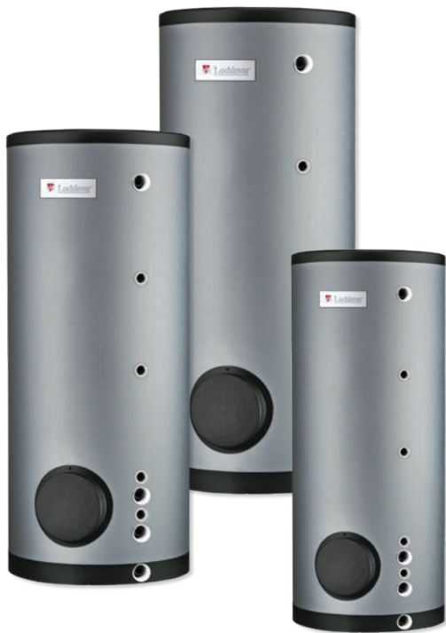
LST direct storage vessel 10 models available

For further information on LST direct storage vessels, please visit www.lochinvar.ltd.uk