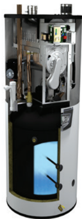
EcoShield water heater internal view