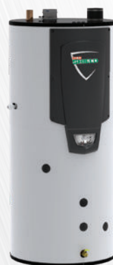
EcoShield water heater 6 models available

With efficiencies of up to 96.45% (building regulations gross CV) and NO x emissions as low as 26mg/kWh, EcoShield water heaters can reduce energy consumption and carbon emissions.