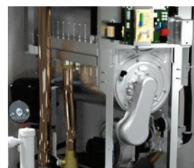
EcoShield heat exchanger

At the heart of the EcoShield Water Heater is a grade 316L stainless steel heat exchanger. This material provides superior resistance to corrosion. The coiled design of the heat exchanger allows for condensation to occur, creating high efficiency, particularly on initial heat up.