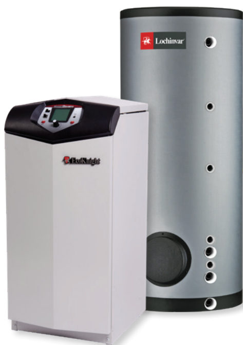
EcoKnight circulating-type gas-fired water heater with LST(R) GE direct storage vessel

LST(R) GE units are frequently installed in conjunction with products like our EcoKnight range; the benefit of this type of water heating method, is that multiple water heater/storage vessel combinations are possible. This can be particularly useful for applications with high hot water demand and can help with equipment location in plant rooms, which are restricted for space.