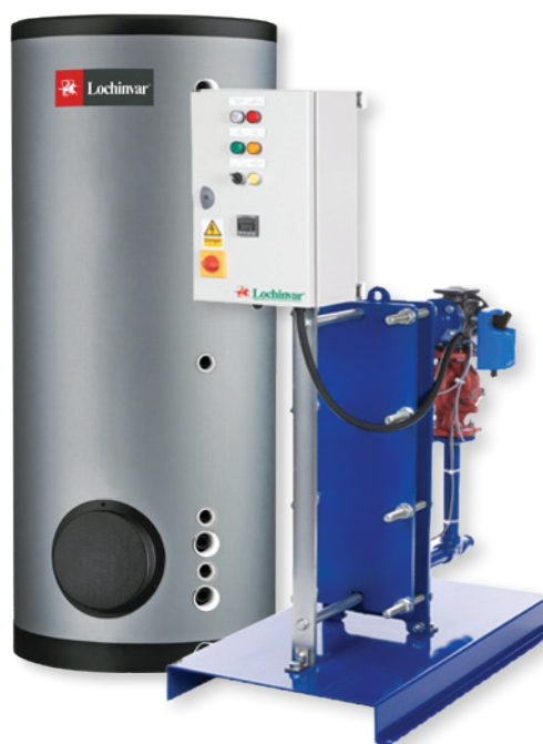
LOK packaged plate heat exchanger with LST(R) GE direct storage vessel

This has become a popular method to provide domestic hot water in certain applications, particularly where space is restricted. In instances where peak demand is required over short periods, it can be beneficial to provide with LST(R) GE direct storage vessels.