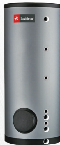
LST(R) GE direct storage vessel 10 models

LST(R) GE direct storage vessels are designed for use with Lochinvar circulating-type water heaters such as our EcoForce, EcoKnight or TTW ranges. They can also be used to provide additional storage for other water heater types including our LOK range of packaged plate heat exchangers.