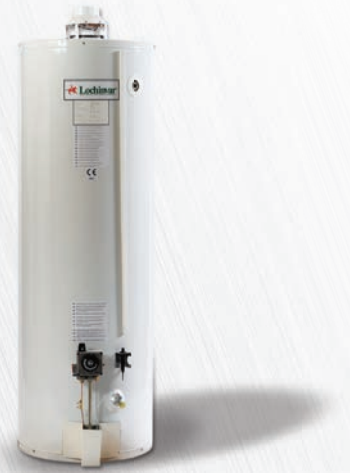
Knight CE permanent pilot water heater

Traditionally hot water systems in commercial and industrial buildings have been supplied indirectly by heating boilers and indirect cylinders - also referred to as calorifiers. This type of system had many operating and logistical inefficiencies especially during the summer months when the main heating boiler was required to run in order to deliver only the buildings hot water requirements. A number of Government sponsored energy saving campaigns have promoted system separation and de-centralization of the heating and hot water plant, a philosophy for which direct gas fired storage water heaters are ideally suited.