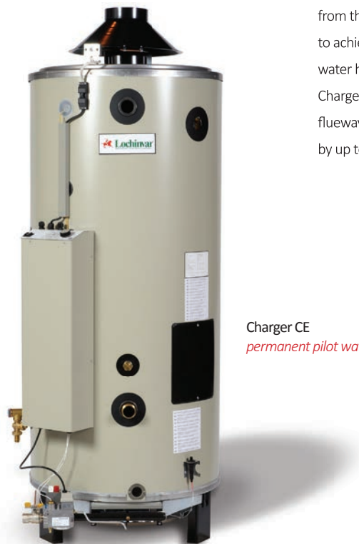
Charger CE permanent pilot water heater

Custom designed steel baffles suspended in the flueways increase the amount of heat transfer from the flue gases. This 'scrubbing' action helps to achieve fast recovery of hot water. All Knight water heaters have a single baffled flueway, Charger models have between 5 and 17 baffled flueways increasing the heat surface area by up to 35%.