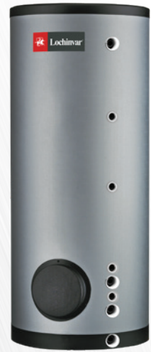
LST(R) GE direct storage vessel 10 models

LST(R) GE direct storage vessels are designed for use with Lochinvar circulating-type water heaters such as our EcoForce, EcoKnight or TTW ranges. They can also be used to provide additional storage for other water heater types including our LOK range of packaged plate heat exchangers.