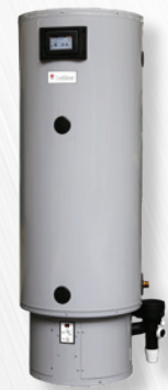
EcoSable 2 models available

In addition to the 5-year storage vessel warranty, EcoSable components are covered by a 2-year warranty.